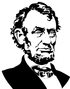
Celebrate 200 Years

Happy New Year to all our members and friends,